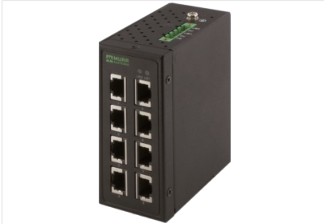
Product van afwijken van afbeelding